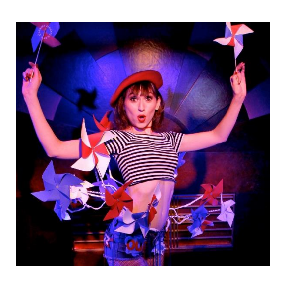
"Leave your troubles outside'...Life is a Cabaret!"